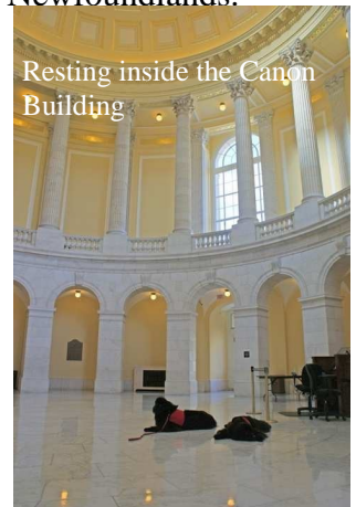
Resting inside the Canon Building

The next morning we loaded back into the RV and readied ourselves for the long journey home knowing there would be more adventures along the way. For everyone involved it was a fun and meaningful excursion filled with great memories and the knowledge that the message about the wonderful work of therapy dogs had been taken to Washington.