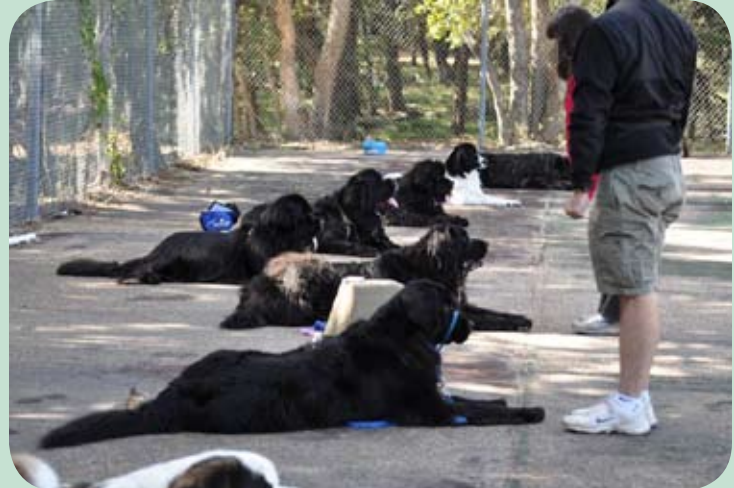
Basic Control...long down exercise. There were 16 dogs in the ring for this exercise! What a great group of dogs and handlers - very impressive!