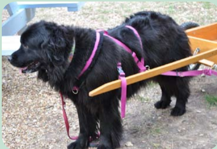
Looking awesome in that pretty pink harness, Jaycee! Ready to roll - let's go mom! Oh, ok...you can take my picture first!