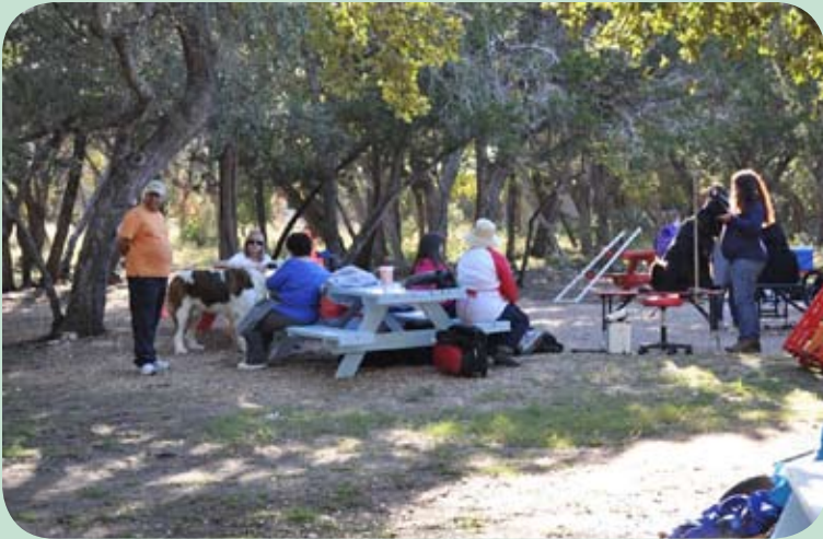
The location is fabulous and the weather was perfect! There was an abundance of trees, shade, picnic tables, and benches throughout the site. A nice way to spend time with our dogs and good friends!